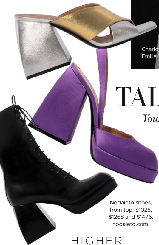
Nodaletto shoes, from top, $1025, $1268 and $1476, nodaletto.com.