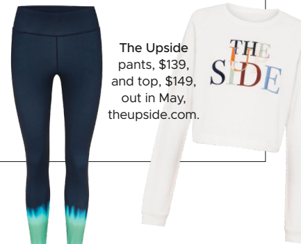
The Upside pants, $139, and top, $149, out in May, theupside.com .