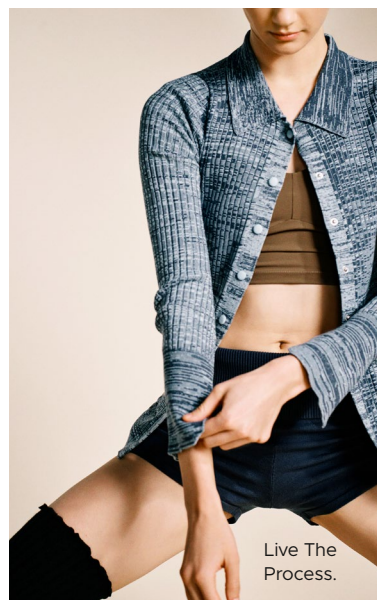
Live The Process.