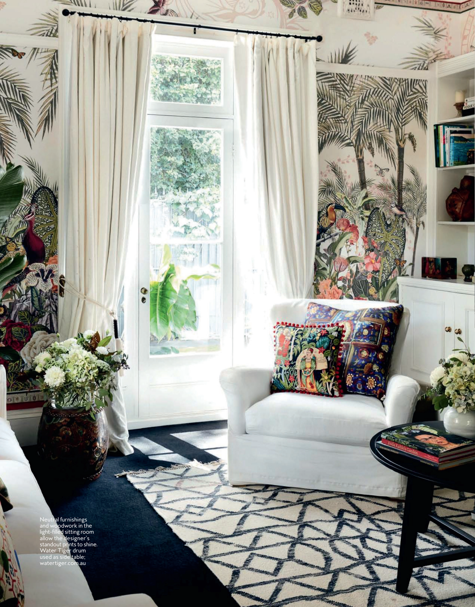
Neutral furnishings and woodwork in the light-filled sitting room allow the designer's standout prints to shine. Water Tiger drum used as side table; watertiger.com.au