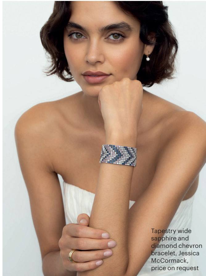
Tapestry wide sapphire and diamond chevron bracelet, Jessica McCormack, price on request